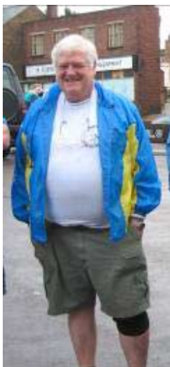
Cheers and On On, Urine

For reasons which remain lost in the mists of time, Macbeth and Just Lizzie left their shoes in the pub. They are currently drying out on a radiator in my flat (the shoes, that is) and may be redeemed at a suitable opportunity.