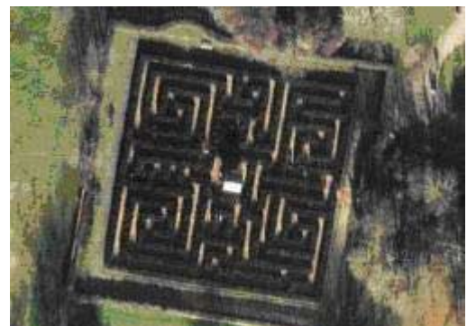
Now if only we had the photo in advance