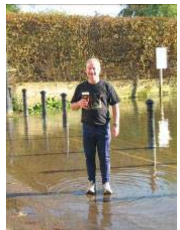
The King of Hares really does walk on water.... (Ed)