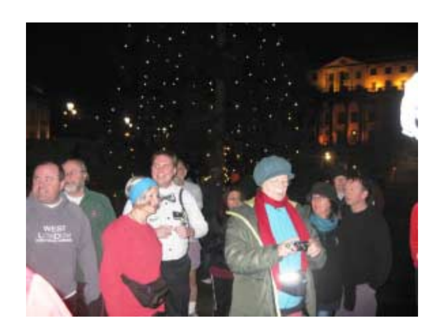
Trafalgar Square – New Year's Day blowing away the cobwebs