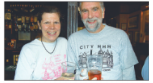
Cheers: Nothing like a good drink after and before a run