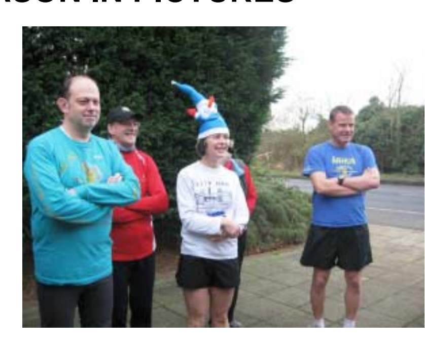
Pre- Christmas Mulled Wine & mince pies Run in Syon Park