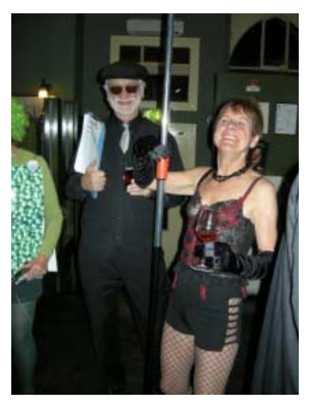
Pole dancer & Pimp at the CLaWs Christmas PPPParty