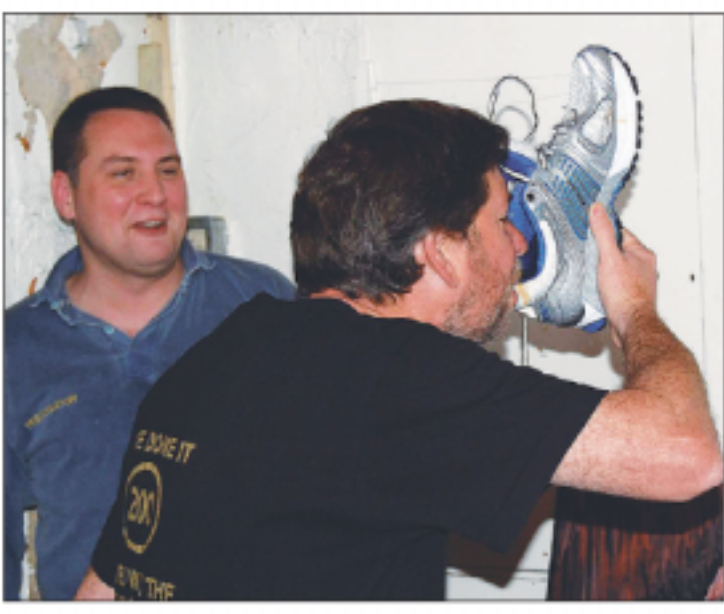
Bottom's up: Hashing rituals for breaking in new trainers can be a little bizarre