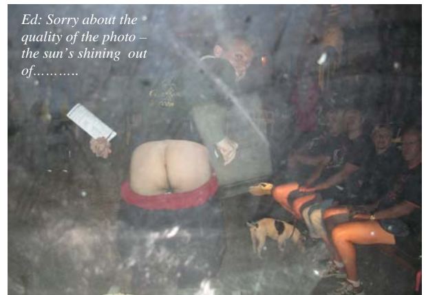
Ed: Sorry about the * quality of the photo – the sun's shining out of.....

To cap it all, it was a good long run on a very warm muggy evening. I have no sense of smell but I'm sure the aroma of filthy perspiring hashers overtook any local country odours.