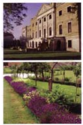
COPPED HALL EPPING, ESSEX CM19 3HS